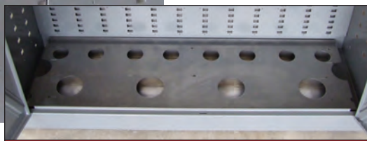
M2 50cal Base Plate - 4 Capacity