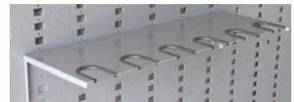
Barrel Bracket - 6 Capacity