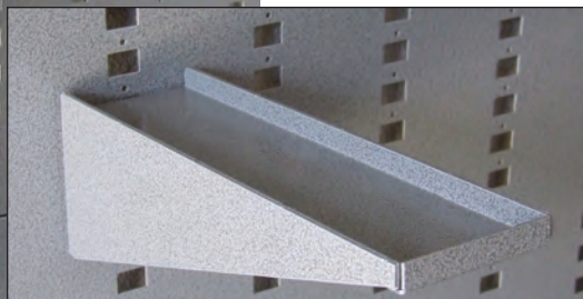
Upper Shelf - 1 Capacity