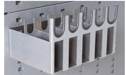
Handgun Cradle - 5 Capacity