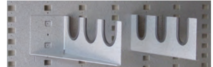
Horizontal Cradle - 3 Capacity