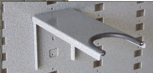
Extra Wide Barrel Bracket or Stock Bracket - 1 Capacity