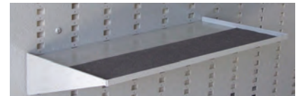
Upper Shelf - 6 Capacity