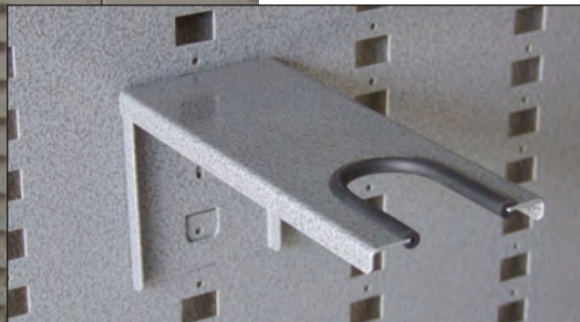
Barrel Bracket - 1 Capacity