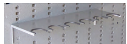
Stock Bracket - 6 Capacity