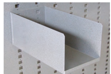
Ammo-Storage Bin - 6 inch